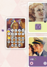
Character card with die Lost Love card Tracking card and cubes